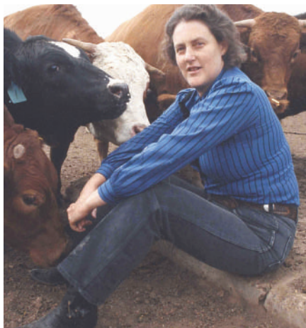
An eye for detail: Temple Grandin believes her autism helps her to see things like a cow does.

There are two remarkable things about Temple Grandin. The first is that she has arguably done more than anyone else in the world to improve the welfare of animals in a practical way. Her major contribution has been to go into places that most of us would probably prefer not to think about — slaughterhouses — and imagine what it would be like to be an animal on its way to being killed. She has dramatically improved the welfare of these animals, not by making